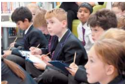
School Library Visit