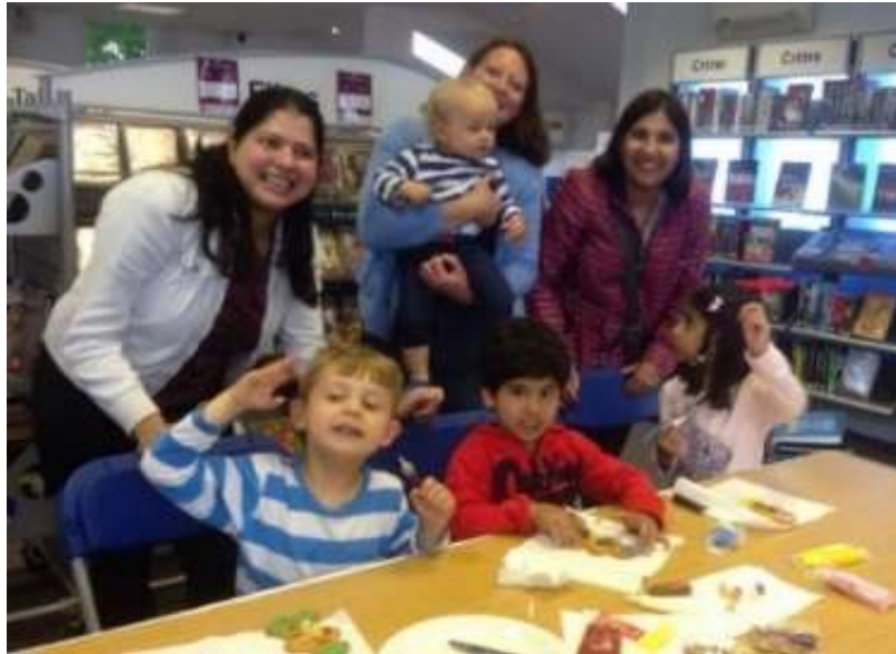
Children's craft activity