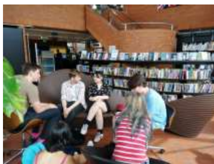
Young People in Maidenhead Library