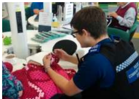
Partnership working with Thames Valley Police at Dedworth Library