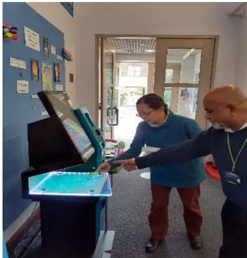
Library Volunteer assisting customer