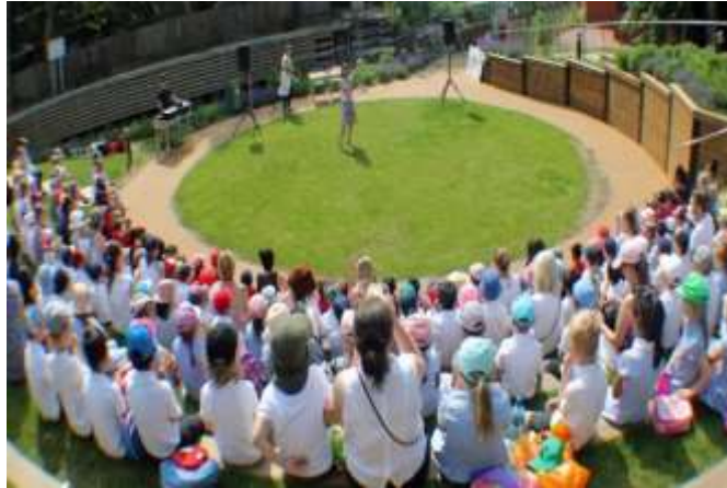
Library Service Summer Reading Challenge supporting literacy