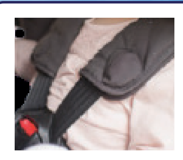
Take the jacket off and tighten the harness, then drape the jacket over the child.