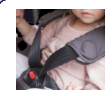
However, when the jacket is removed and the harness is kept on the same setting the harness is very loose.