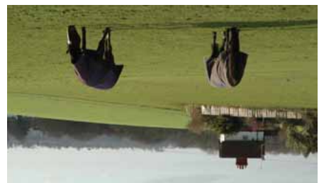
A picturesque view from Hindhay Farm

Walk 1 until directed to shorter walks. There is plenty of parking available. All walks start with 2 football pitches, tennis courts and a lawn green bowling park's generous size hosts an extensive children's play area, original at Oaken Grove Park in Pinkneys Green. The Pinkneys Green and Furze Platt. The start of all 3 walks in Maidenhead with sights around Oaken Grove, Furze Platt and Farnham.