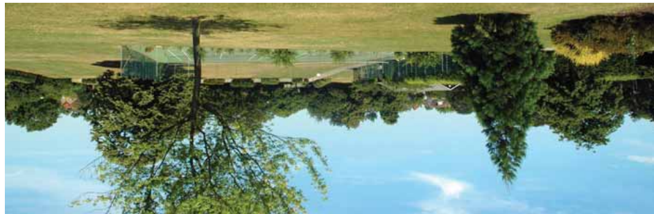
A leisurely walk or a vigorous game of tennis at Oaken Grove - it's your choice!