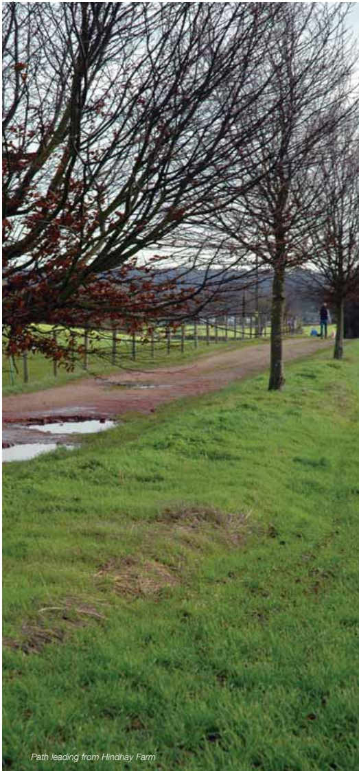
Path leading from Hindhay Farm